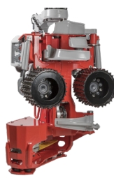
LOG MAX 3000T